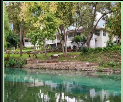
Comal River Retreat: June 26 - 30th; Cost: $400

Staff needed: People to help with lunch, clothes coordinator and assistants, and decorators.